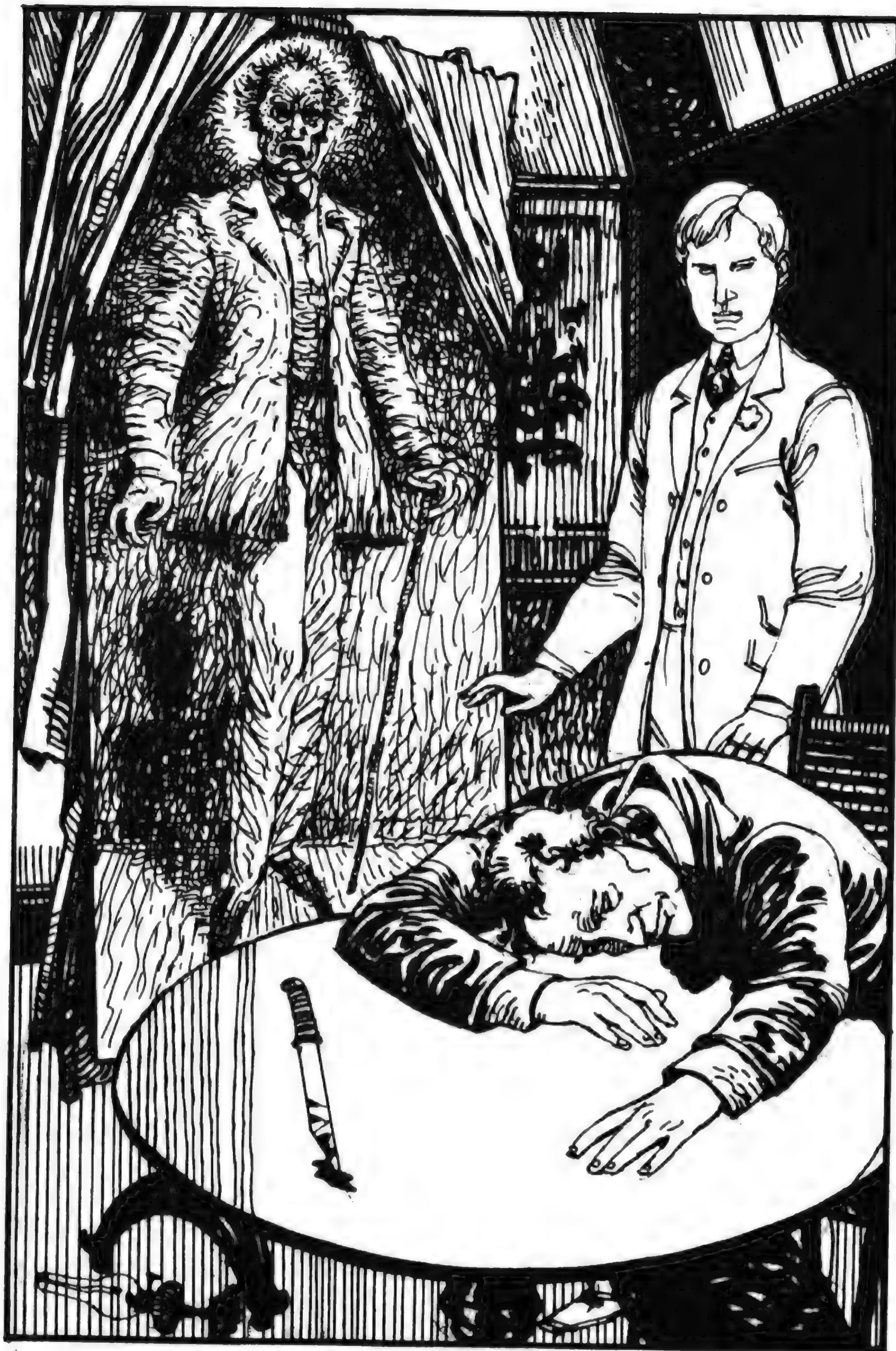
Dorian threw the knife down on the table and stood back. He could hear nothing but the sound of blood falling on to the carpet.

He threw the knife down on the table and stood back. He could hear nothing but the sound of blood falling on to the carpet. He opened the door and went out on to the stairs. The house was completely quiet. No one was there.