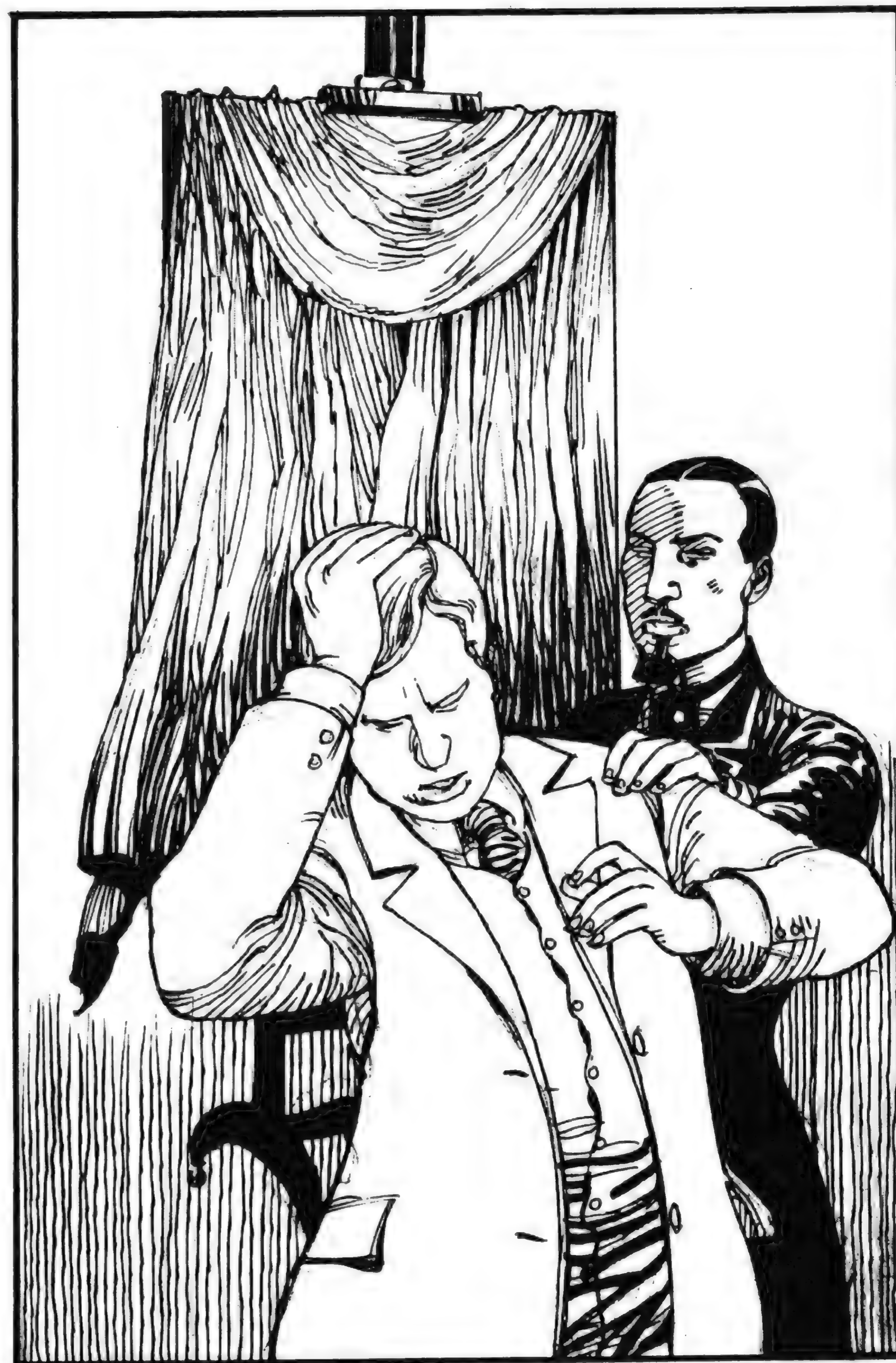
A cry of pain came from the boy's lips and he jumped to his feet. 'Dead! Sibyl dead! It is not true! It is a horrible lie!'

They were silent. The evening darkened in the room. After some time Dorian Gray looked up. 'How well you know me! But we