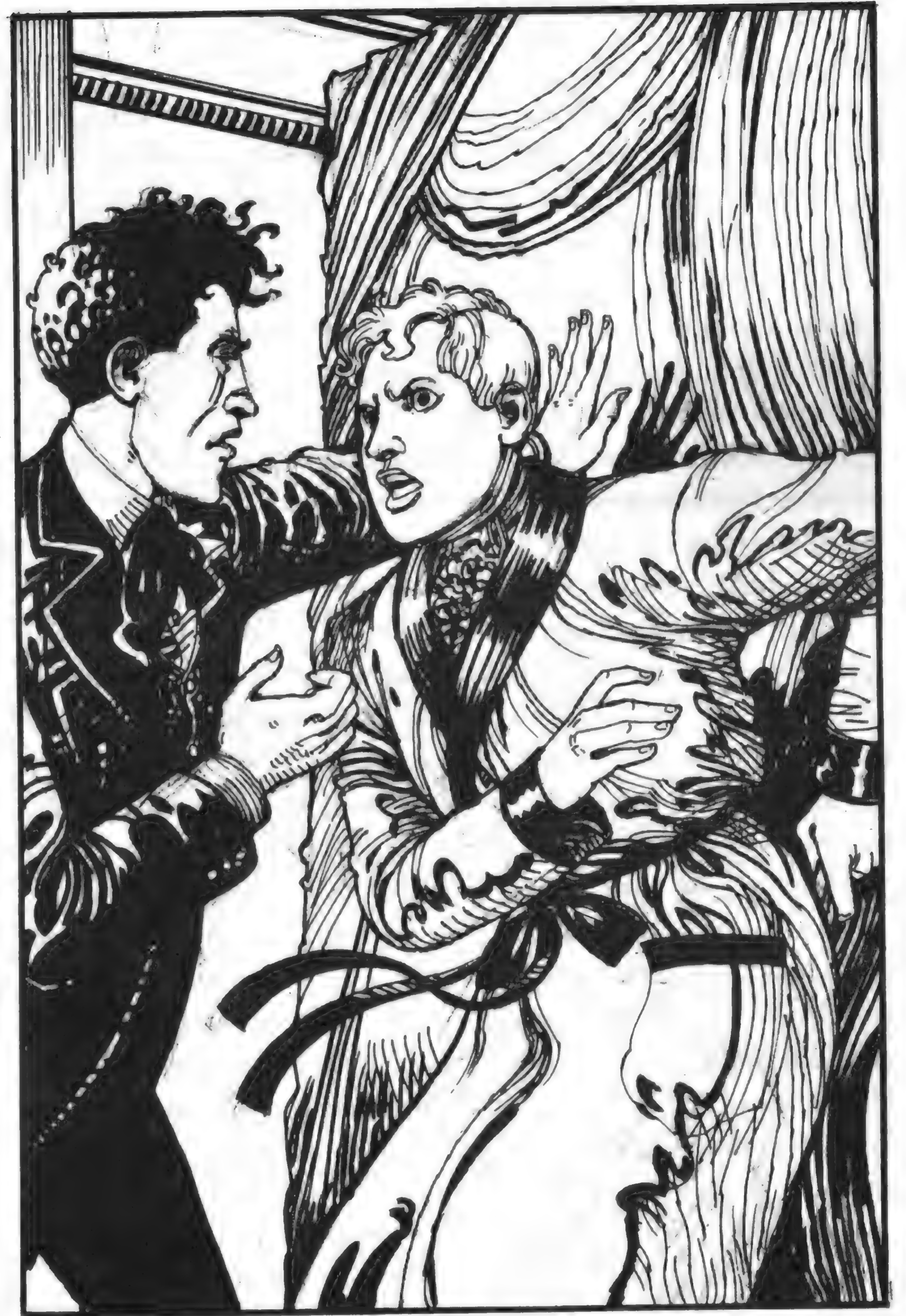
A terrible cry came from Dorian Gray’s lips, and he rushed between the painter and the covered portrait.

Hallward looked at Dorian Gray in surprise. He had never seen him like this before. The boy’s face was white and angry.