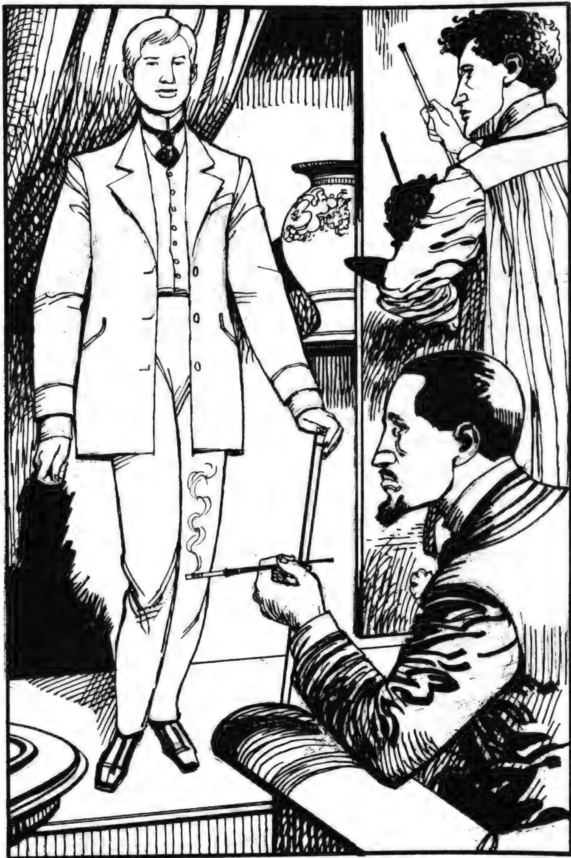
Lord Henry watched him. He knew the exact moment when to say nothing.

touched his soul. Yes, there had been things in his boyhood that he had not understood. He understood them now.