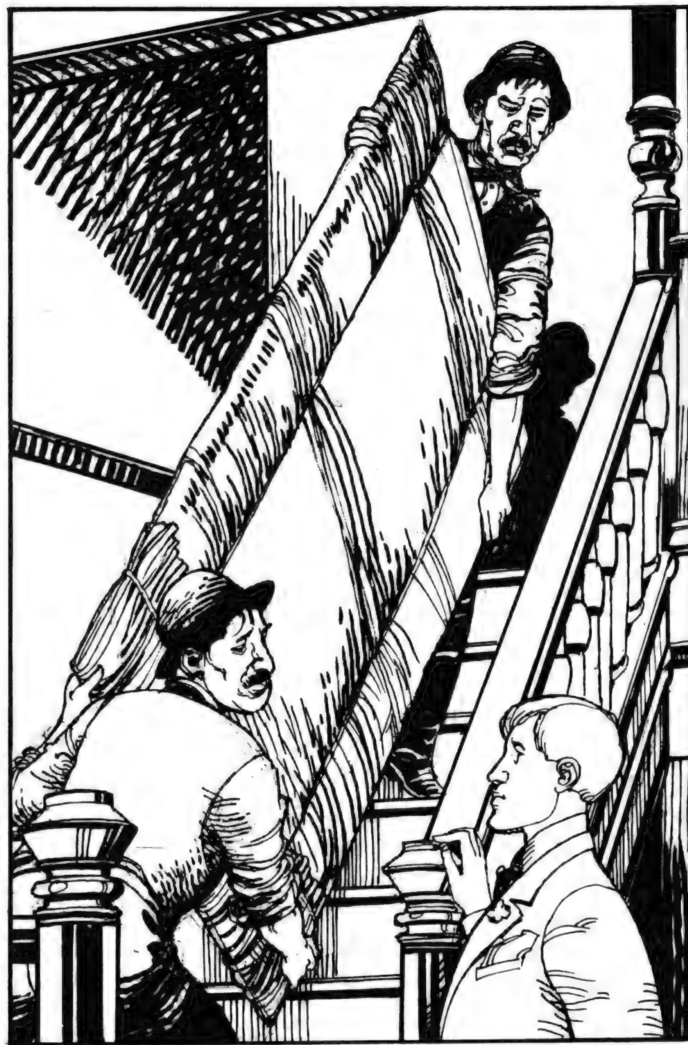
‘It’s very heavy, sir,’ said one of the men, as they climbed the stairs.

When the men had gone, Dorian locked the door, and put the key in his pocket. He felt safe now. No one would ever look at that horrible thing. Only he would ever see his shame.