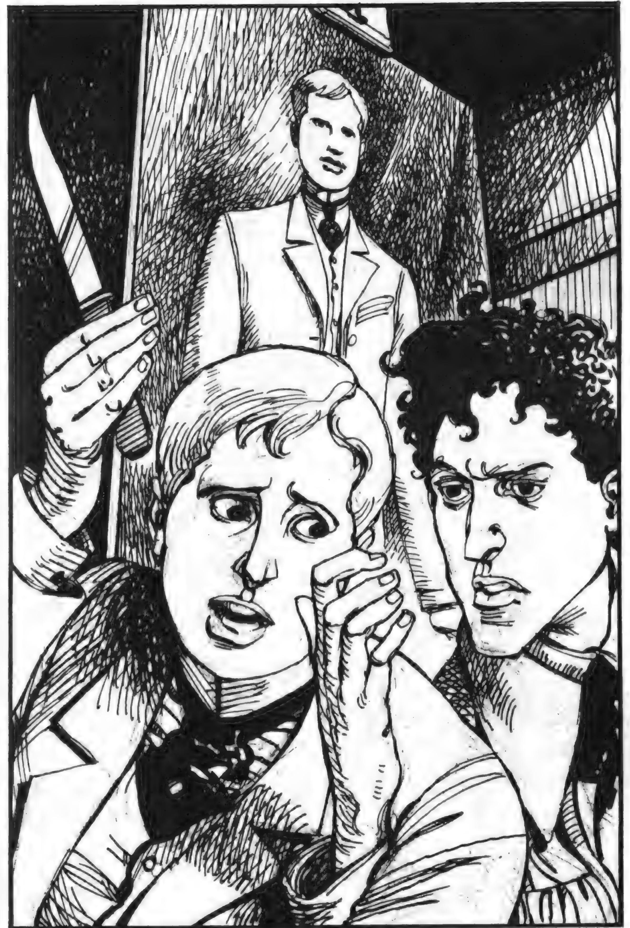
'Don't, Basil!' he cried. 'Don't murder it!'

'Well, you and I will go together, Mr Gray.'