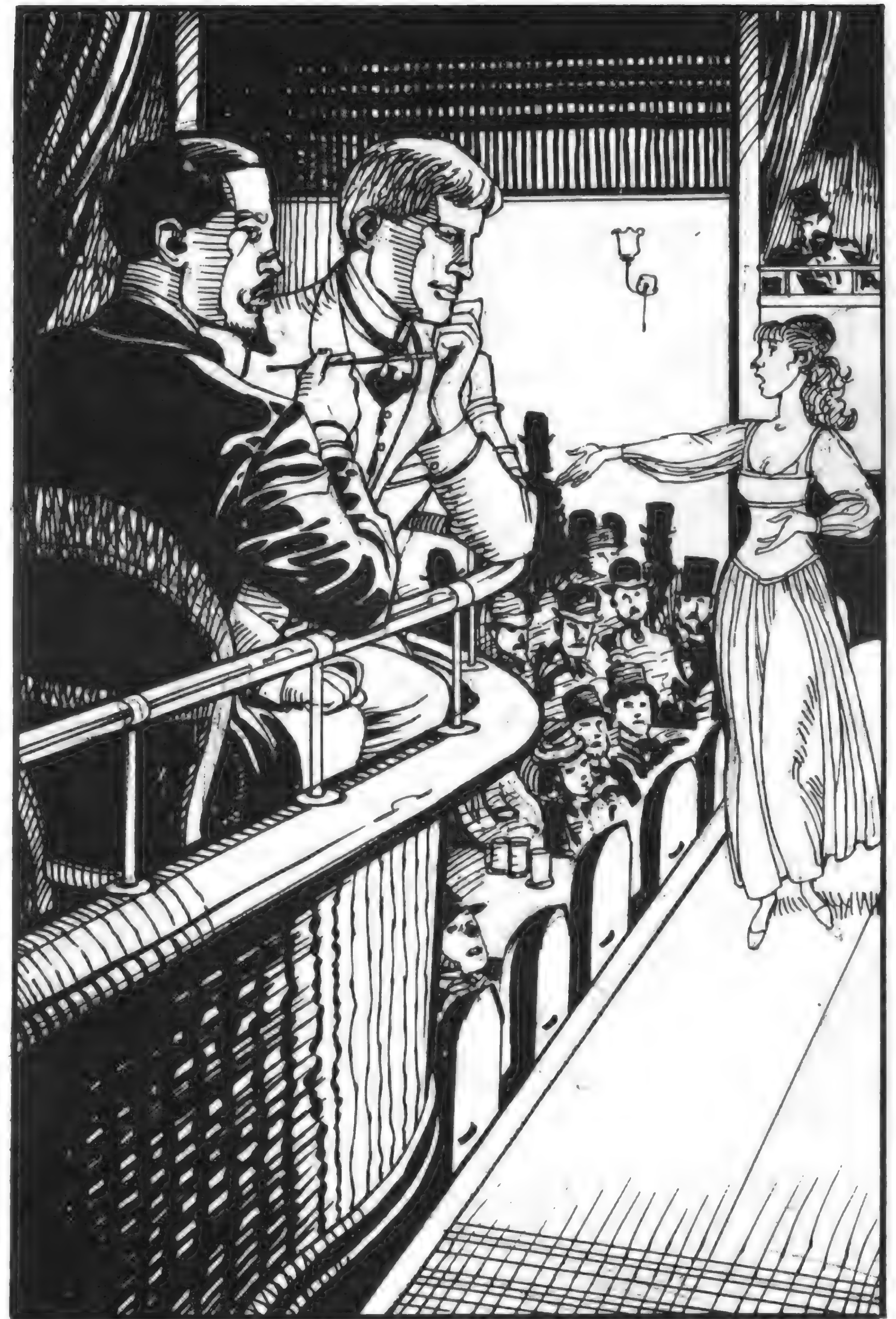
Then Sibyl appeared. Yes, she was certainly lovely to look at, Lord Henry thought.

Lord Henry got up from his chair and put on his coat. ‘She is beautiful, Dorian,’ he said, ‘but she can’t act. Let’s go.’